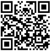
QR Code to Sign Up

Worship Volunteers , It takes many hands to make this service amazing!! Join us in helping!