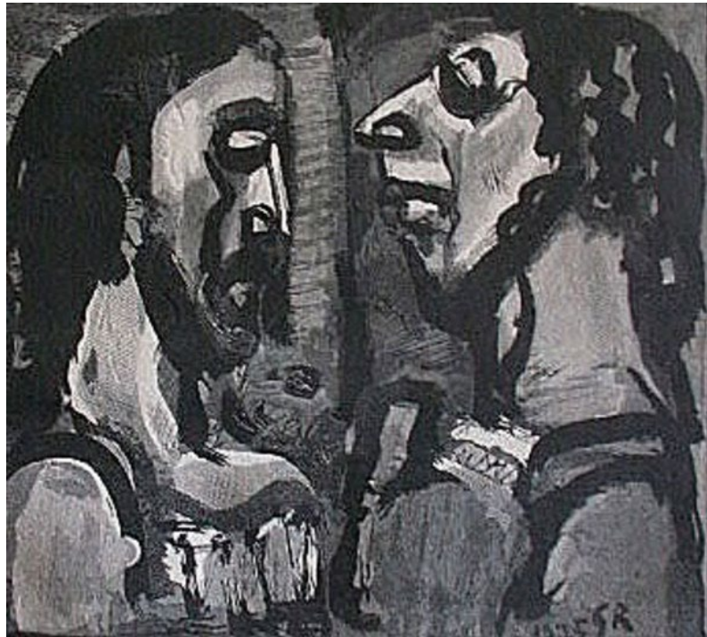
Georges Rouault, Christ condemned by Pilate wood engraving, 1939