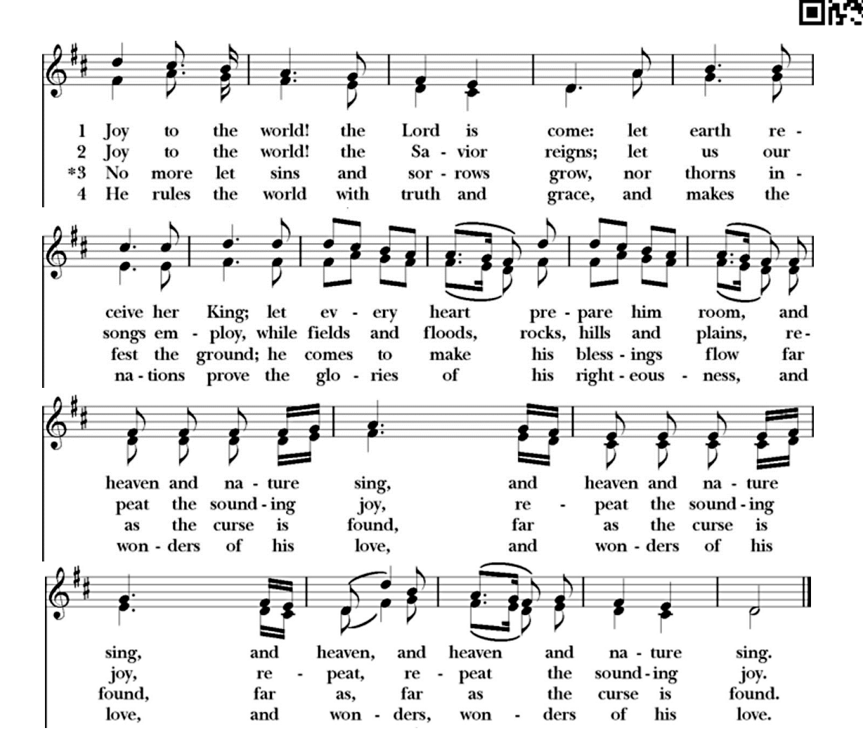
Please rise in body or in spirit

During the hymn we will be passing the offering plates. If you prefer to give online, you can text CHT DONATE to 73256 or scan the QR Code to the right. Your generous gifts go to support our Open Hearts Café, the magnificent Music Programs by our Choir, our amazing staff and this beautiful building.