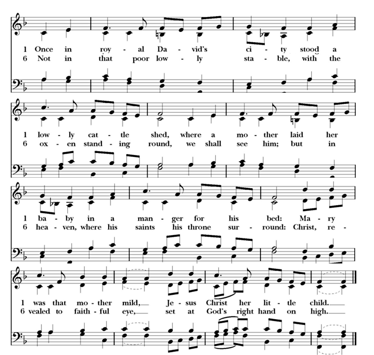
Narrator Stars brighten slowly in the sky. All creation hold its breath. Suddenly from the stable comes the cry of a newborn child! Mary gently wraps the baby in a blanket and lays him in the feedbox that his father has filled with straw.